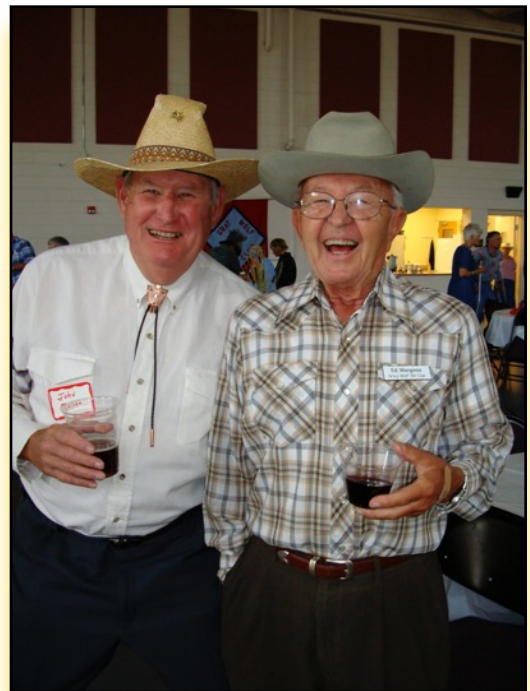
Gray Wolf Western Party 2009