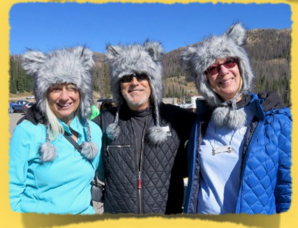
A pictorial account of our Annual Tail Gate Party at Wolf Creek Ski Area. Tues. 10/3/17