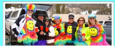
Closing Day at Wolf Creek 2013